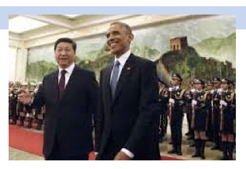
The White House Office of the Press Secretary