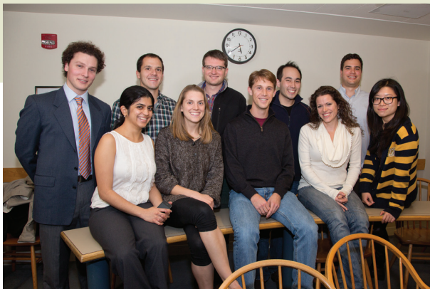
HEEP Pre-Doctoral Fellows attend a weekly seminar hosted by the Harvard Environmental Economics Program.

In recent years, Pre-Doctoral Fellows have gone on to become faculty members at Columbia, Duke, Tufts, New York, and Tsinghua (Beijing) Universities; INSEAD and the Universities of Michigan and Minnesota; and Amherst, Dartmouth, and Colby Colleges; Fellows at Resources for the Future and Columbia University's Earth Institute; and hold key positions in government agencies—including the White House and the U.S. Energy Information Administration—and non-governmental organizations, including the Environmental Defense Fund.