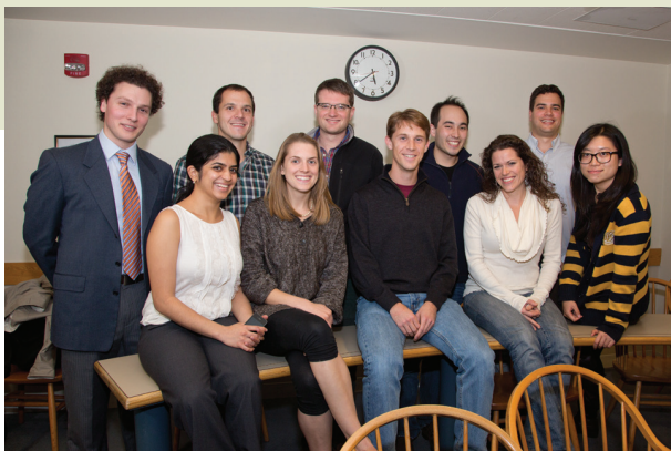
HEEP Pre-Doctoral Fellows attend a weekly seminar hosted by the Harvard Environmental Economics Program.

In recent years, Pre-Doctoral Fellows have gone on to become faculty members at Columbia, Duke, Tufts, New York, and Tsinghua (Beijing) Universities; INSEAD and the Universities of Michigan and Minnesota; and Amherst, Dartmouth, and Colby Colleges; Fellows at Resources for the Future and Columbia University's Earth Institute; and hold key positions in government agencies—including the White House and the U.S. Energy Information Administration—and non-governmental organizations, including the Environmental Defense Fund.