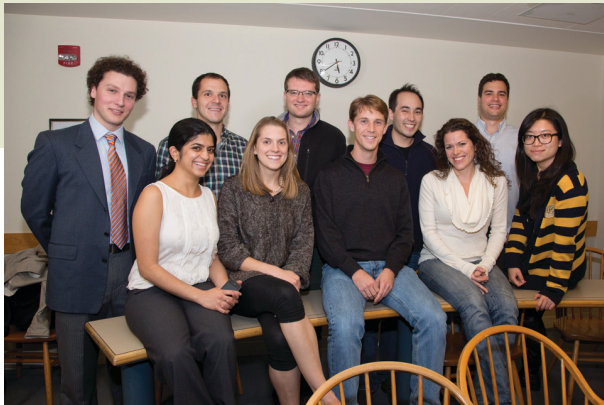
HEEP Pre-Doctoral Fellows attend a weekly seminar hosted by the Harvard Environmental Economics Program.

In recent years, Pre-Doctoral Fellows have gone on to become faculty members at Columbia, Duke, Tufts, New York, and Tsinghua (Beijing) Universities; INSEAD and the University of Michigan; and Amherst, Dartmouth, and Colby Colleges; Fellows at Resources for the Future and Columbia University's Earth Institute; and hold key positions in government agencies—including the White House and the U.S. Energy Information Administration—and non-governmental organizations, including the Environmental Defense Fund.